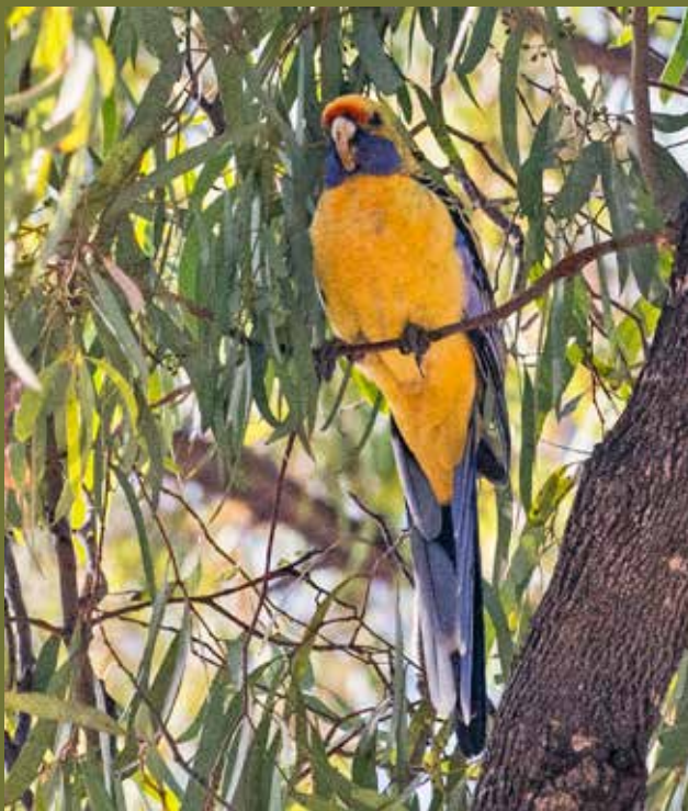
Pulling out of Morgan - free ferry - Yellow version of the Crimson Parrot and one of many houseboats on the Murray