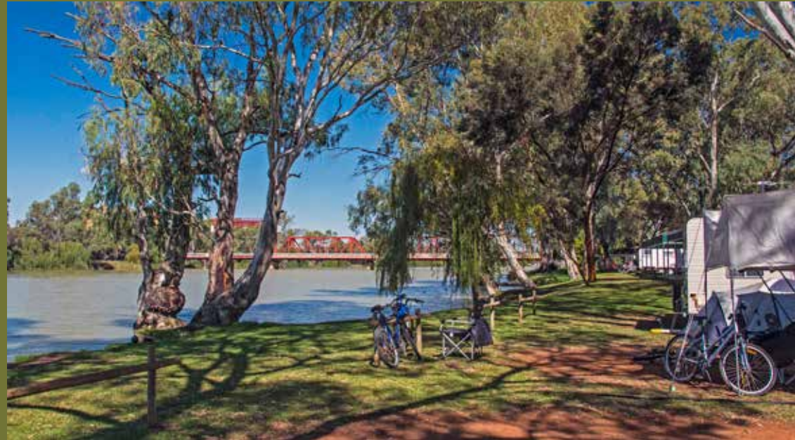
House-boat ~ more like a floating garbage dump tied up at Renmark... Our 'van park Renmark - very nicely situated on the river