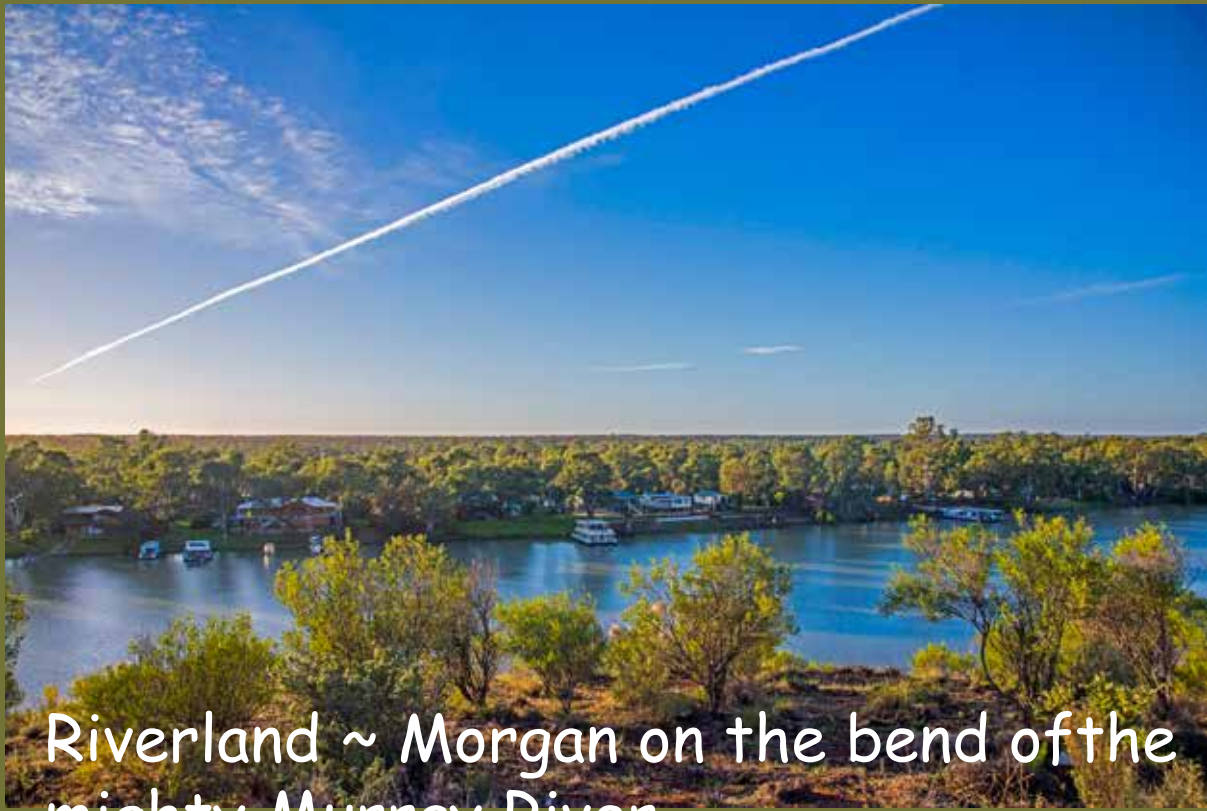
Riverland ~ Morgan on the bend of the mighty Murray River...